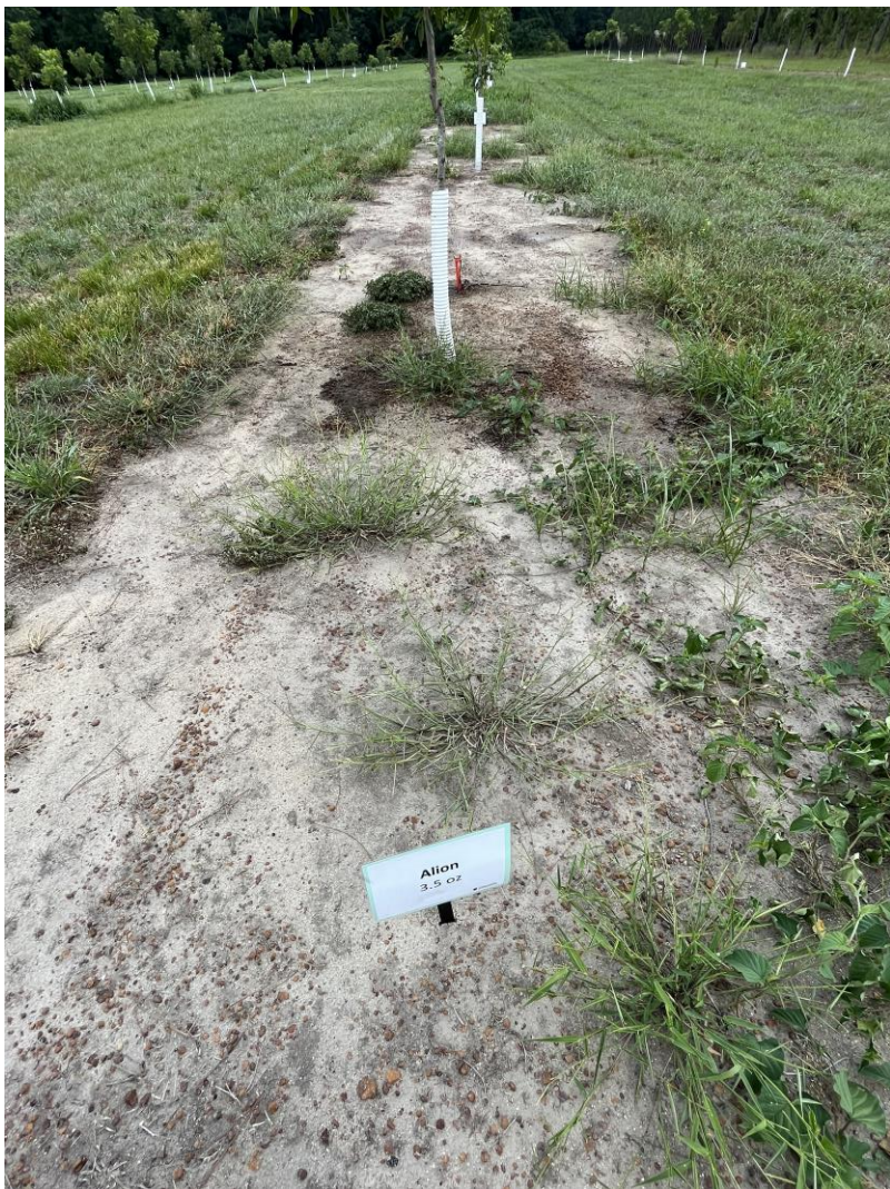
90 DAT (2023)