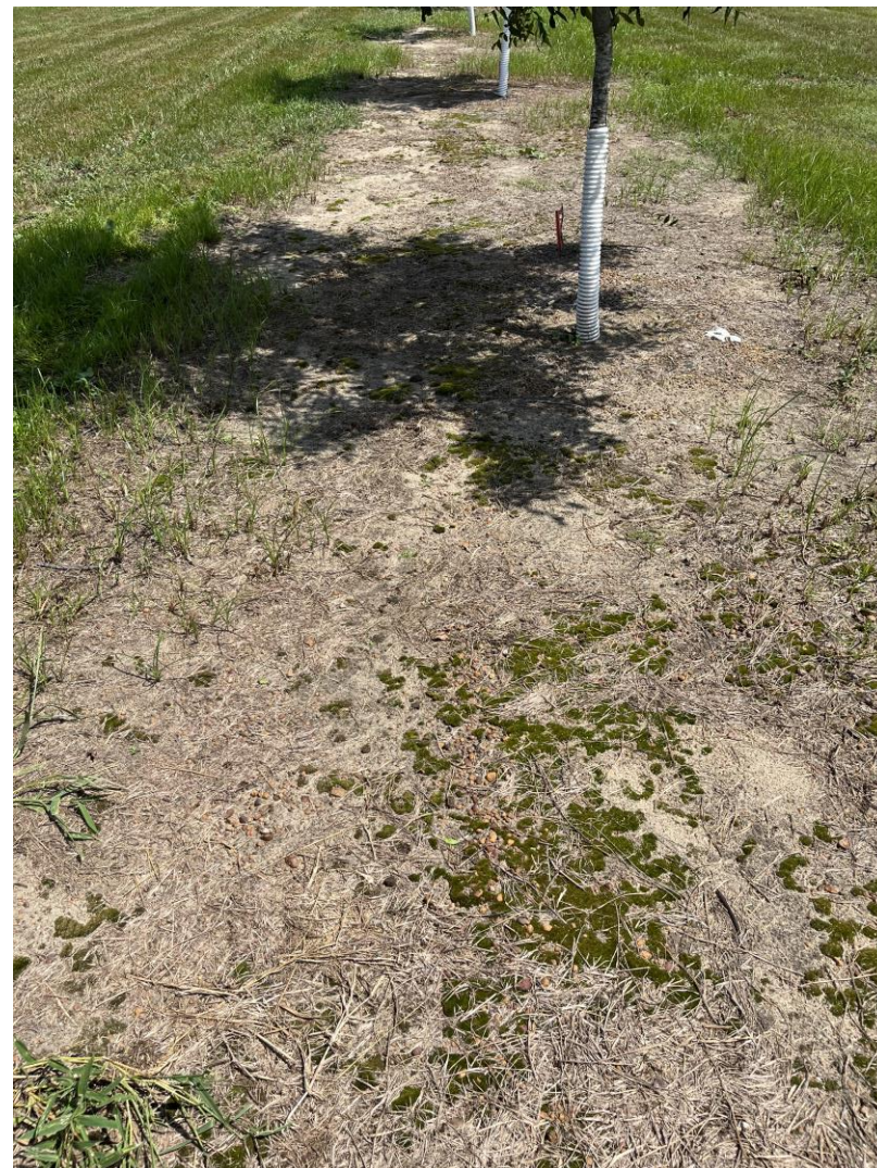
160 DAT (2024)